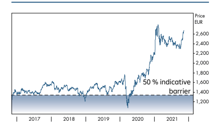
As of November 8, 2021; Source: Reuters (.SOHYDR3)

Please note that the performance of the index from November 9 2016 to May , 2021 is based on a simulated past performance and that past performance is no reliable indicator for future performance of this underlying.